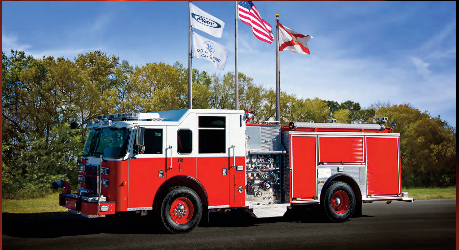
Pierce Saber Pumper City of Jersey City Job #27901