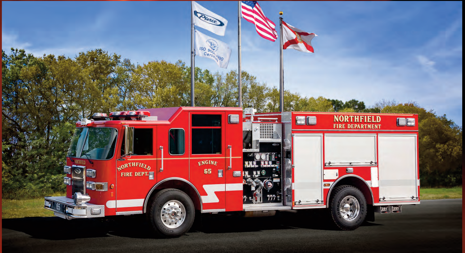
Pierce Saber Pumper City of Northfield Job #27991