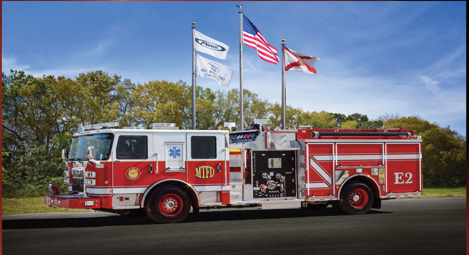
Pierce Saber Pumper Morris Township Job #30393