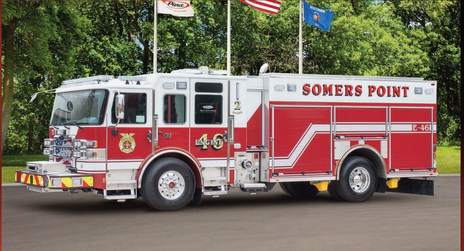
Pierce Enforcer PUC Pumper City of Somers Point Job #34664