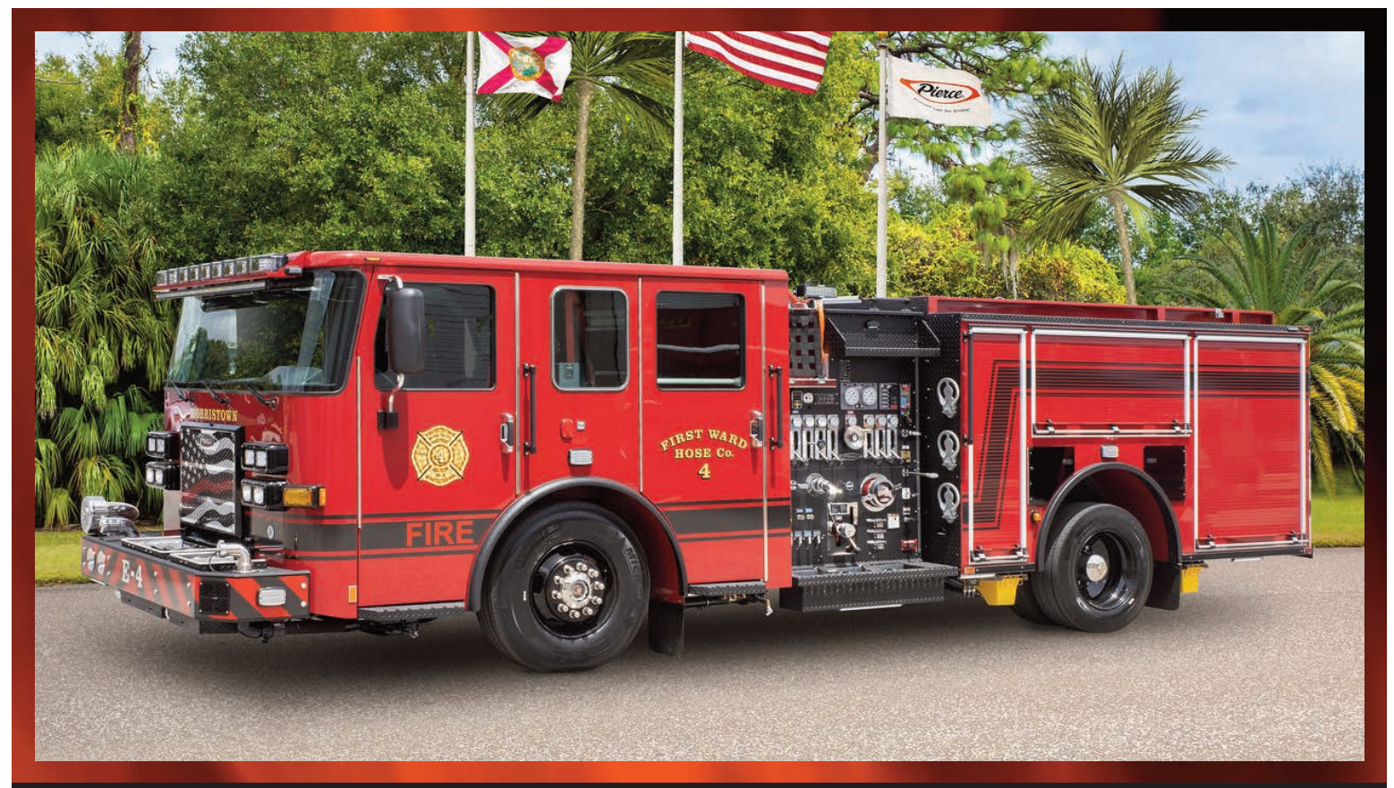
Pierce Saber Pumper Town of Morristown Job #35792