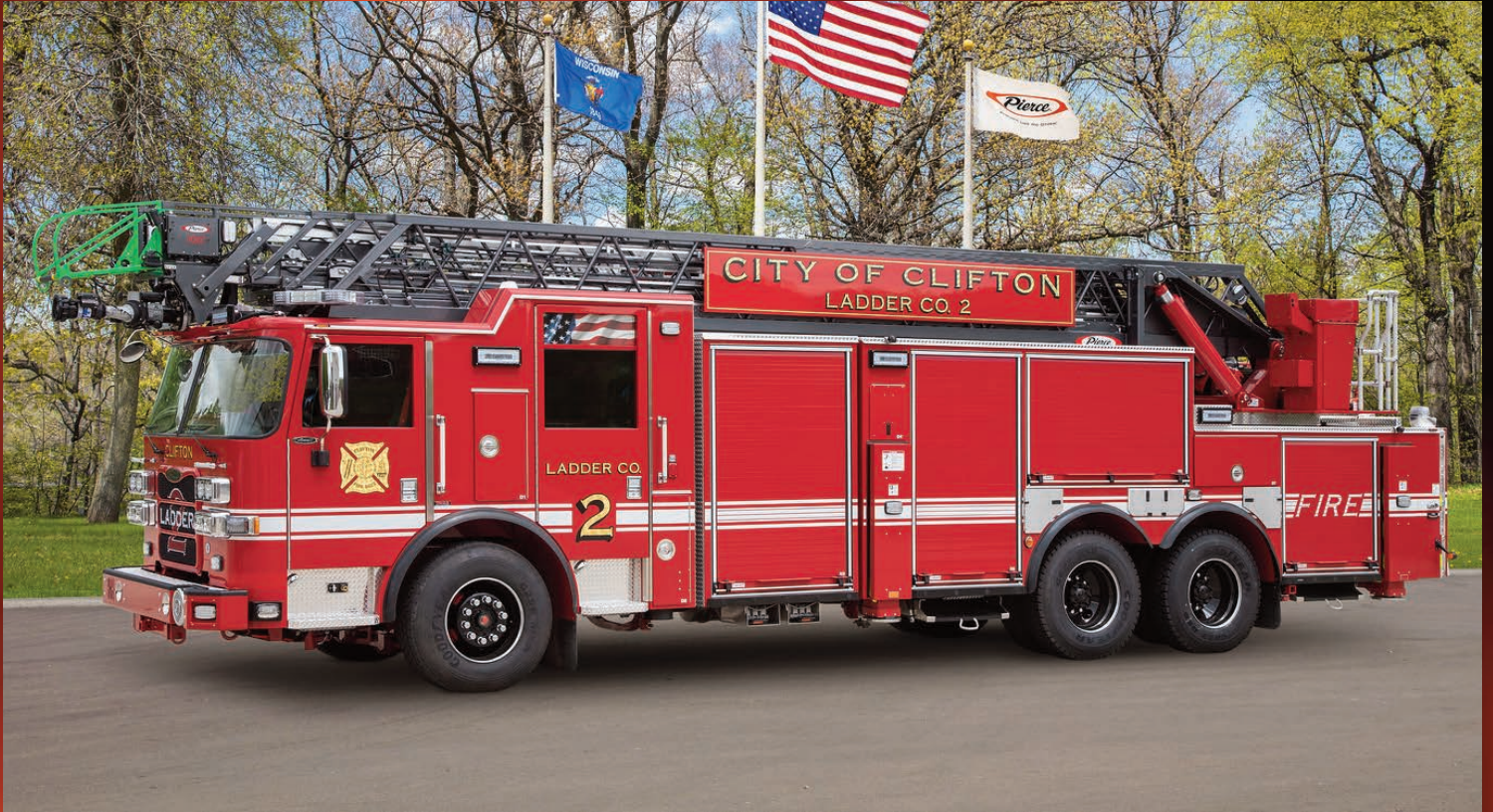
Pierce Arrow XT 100' Ladder City of Clifton Job #36273