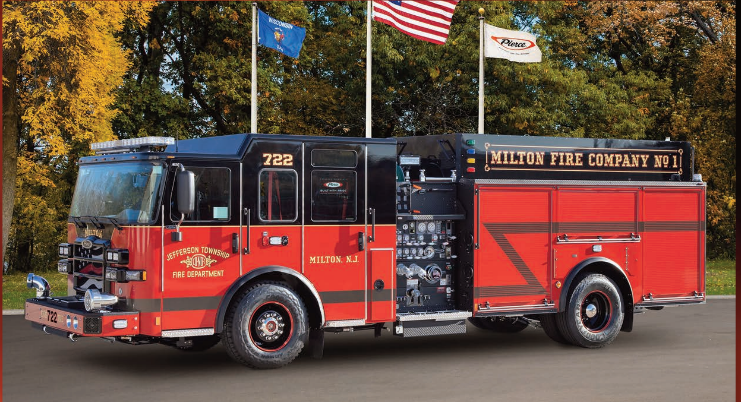
Pierce Enforcer Pumper Jefferson Township Job #37001