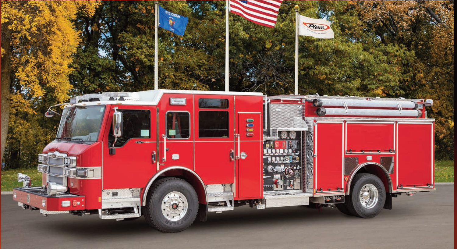
Pierce Impel Pumper Mansfield Twp./Franklin Fire Co. #1 Job #37000