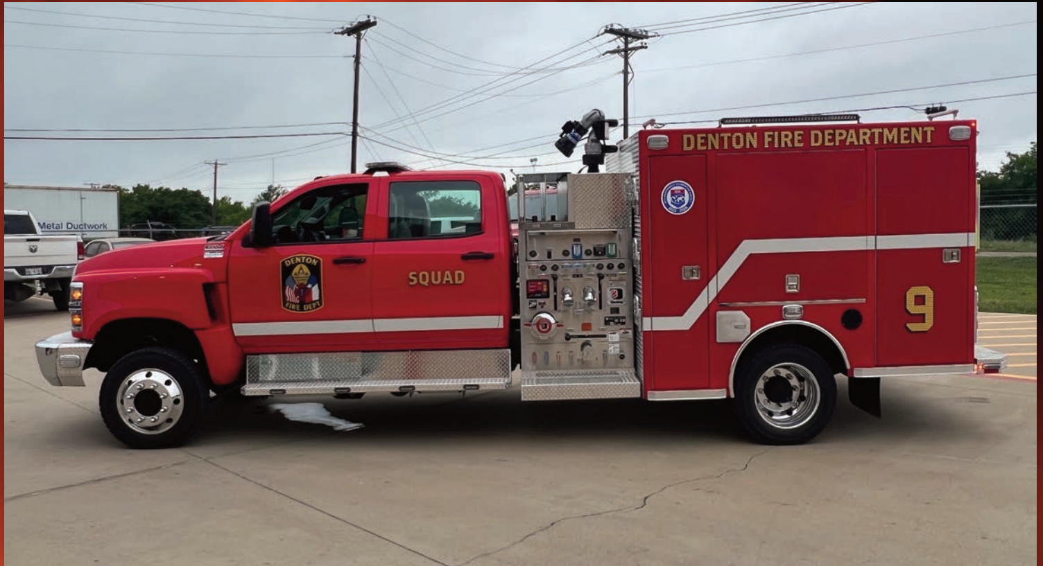
Skeeter Mini-Pumper Skeeter Demo Job #7108