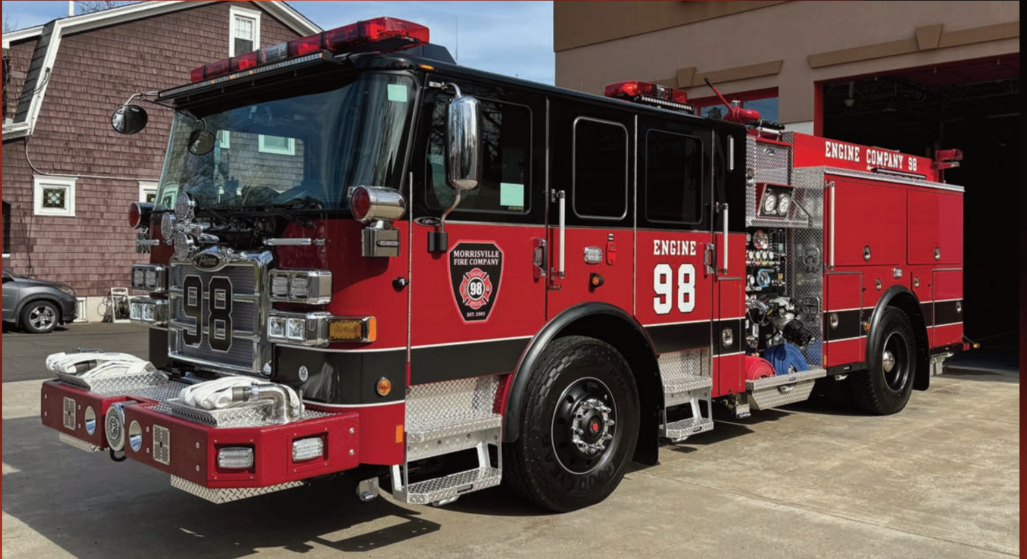
Pierce Enforcer Pumper Morrisville (PA) Fire Company Job #38280