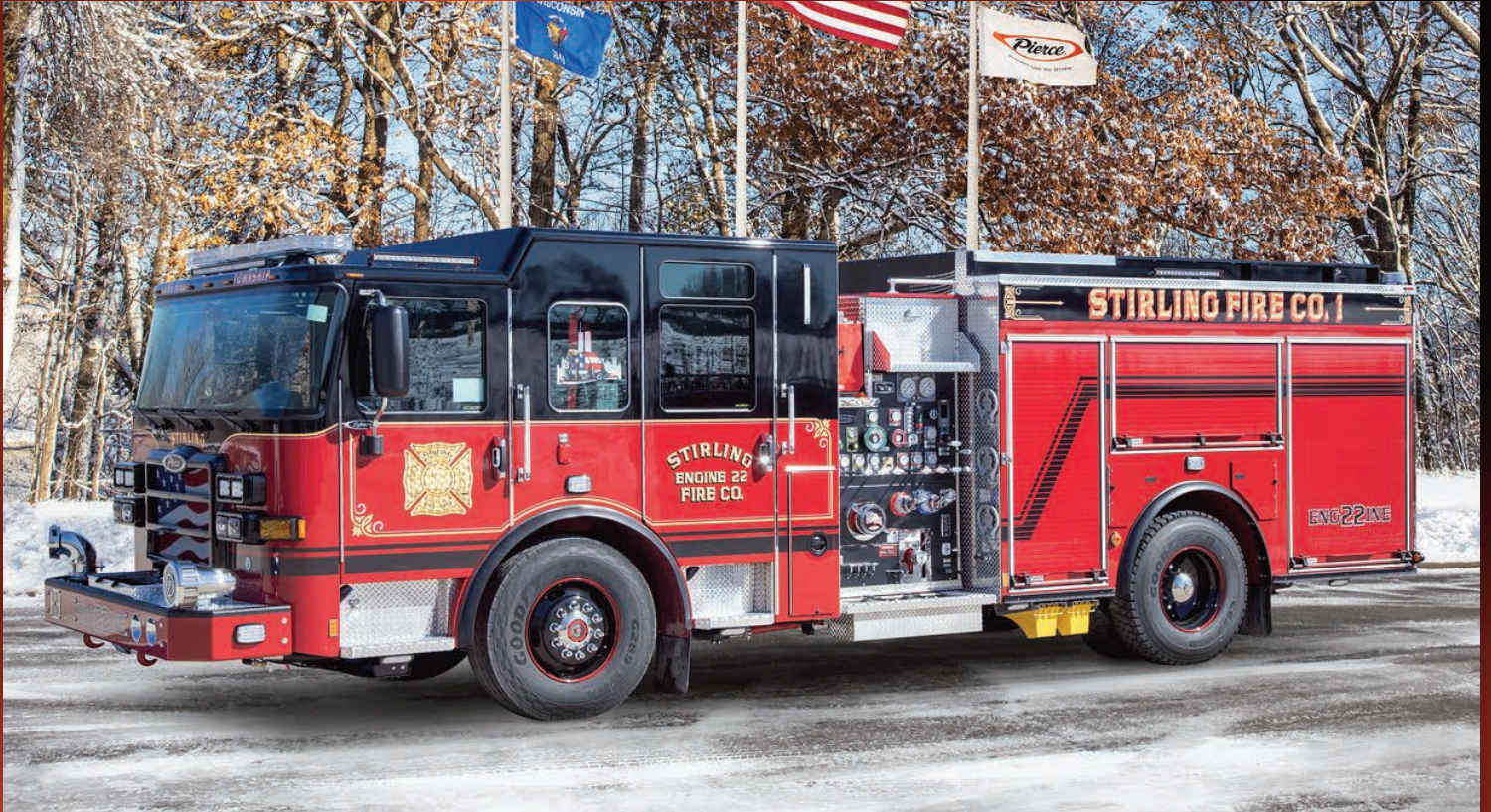
Pierce Enforcer Pumper Township of Long Hill/Stirling Fire Co. Job #39068