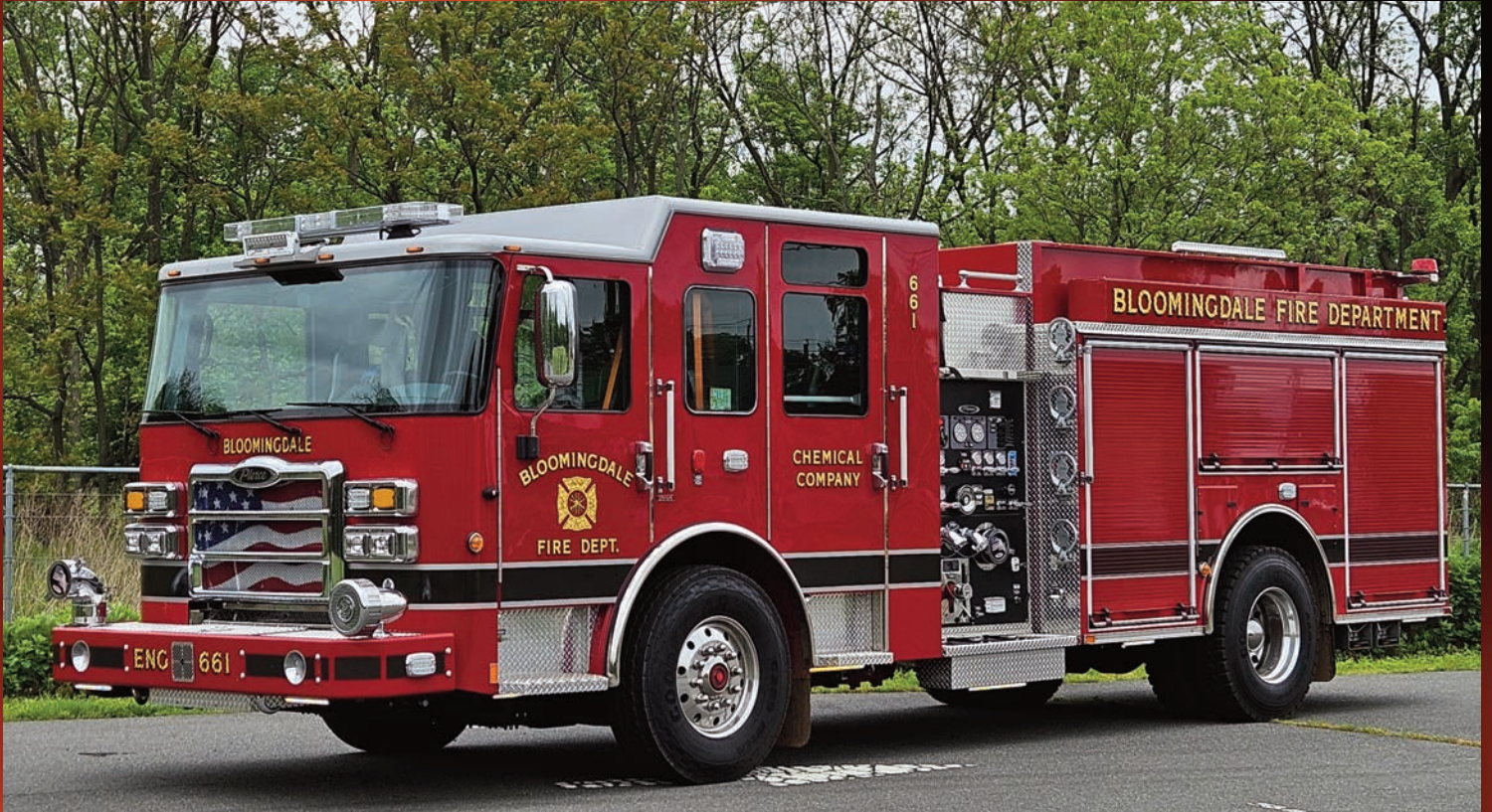
Pierce Saber Pumper Borough of Bloomingdale Job #41065