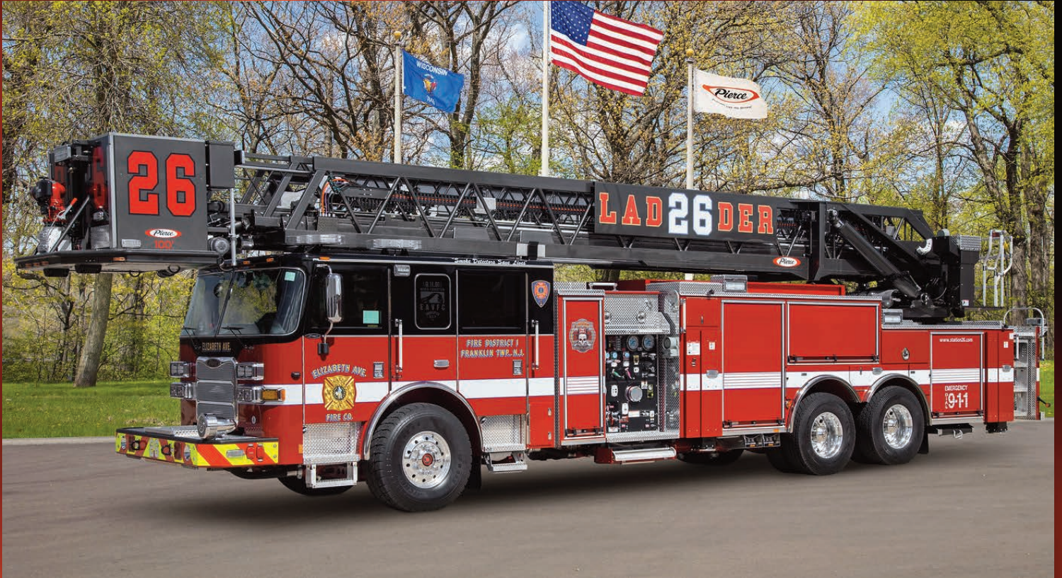
Pierce Arrow XT 100' Platform Franklin Fire Dist. #1/Elizabeth Ave. Fire Co. Job #38020