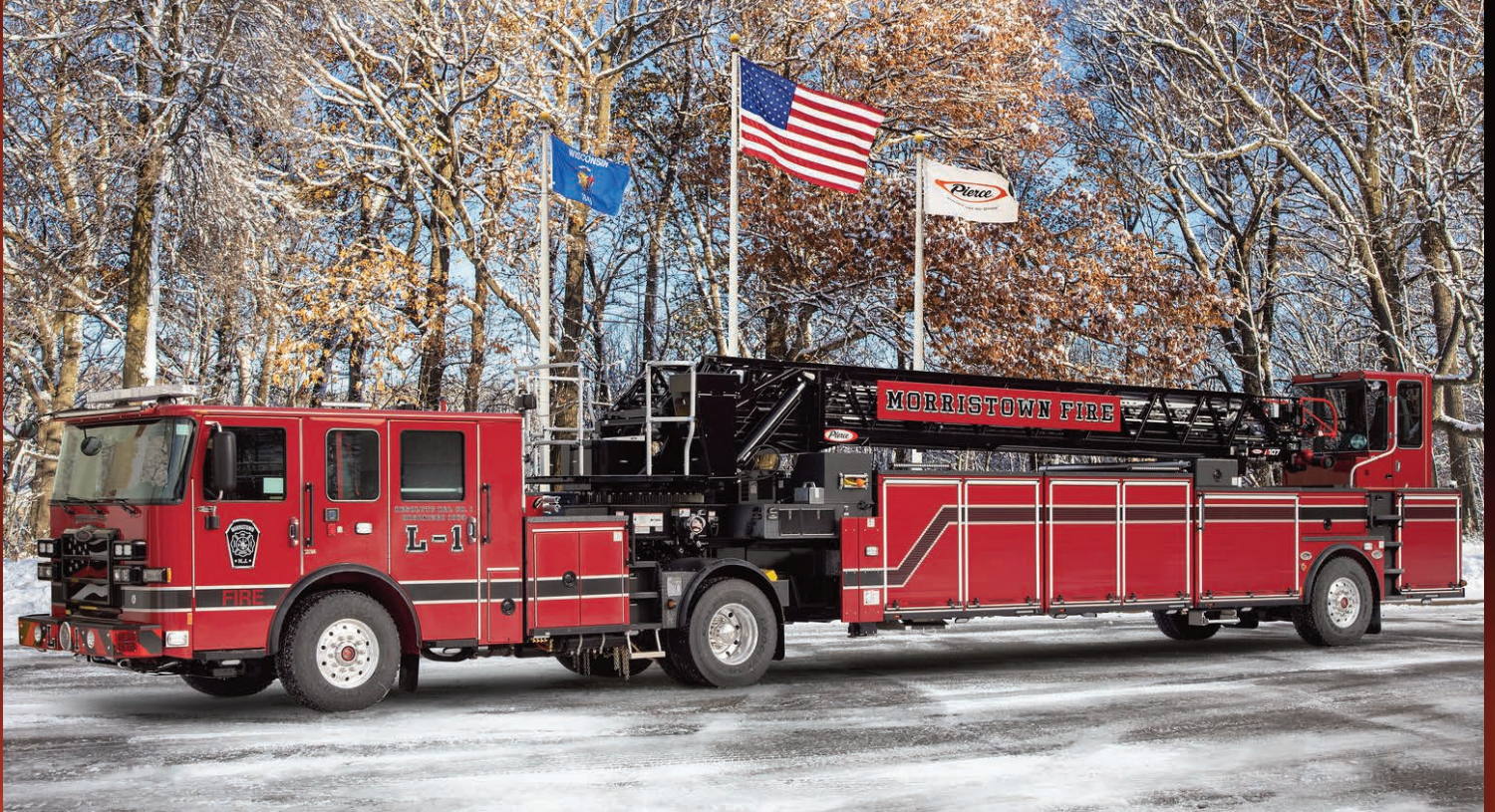
Pierce Enforcer 107' Ascendant Tiller Town of Morristown Job #38052