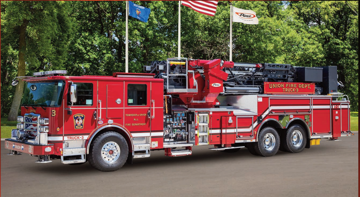
STOCK - Pierce Enforcer 100' Midmount Tower Union Township Job #41580