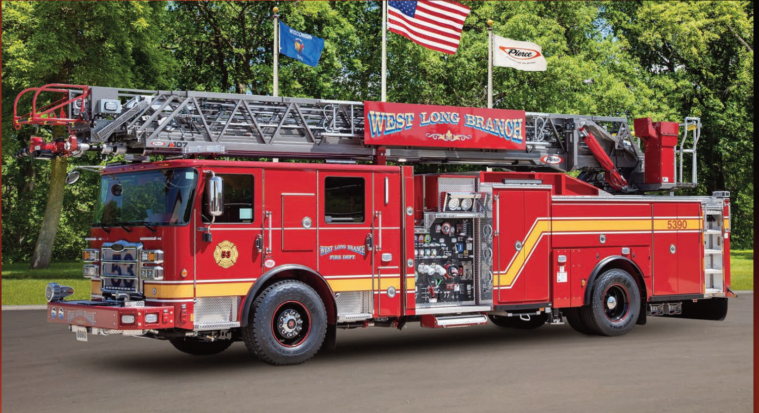
Pierce Enforcer 107' Ascendant Ladder Borough of West Long Branch Job #38261