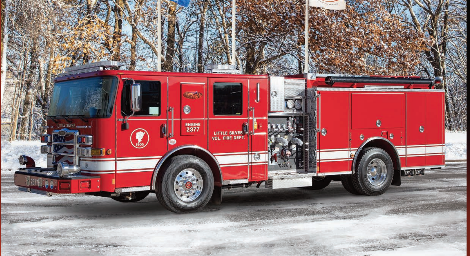
Pierce Enforcer Pumper Borough of Little Silver Job #39163