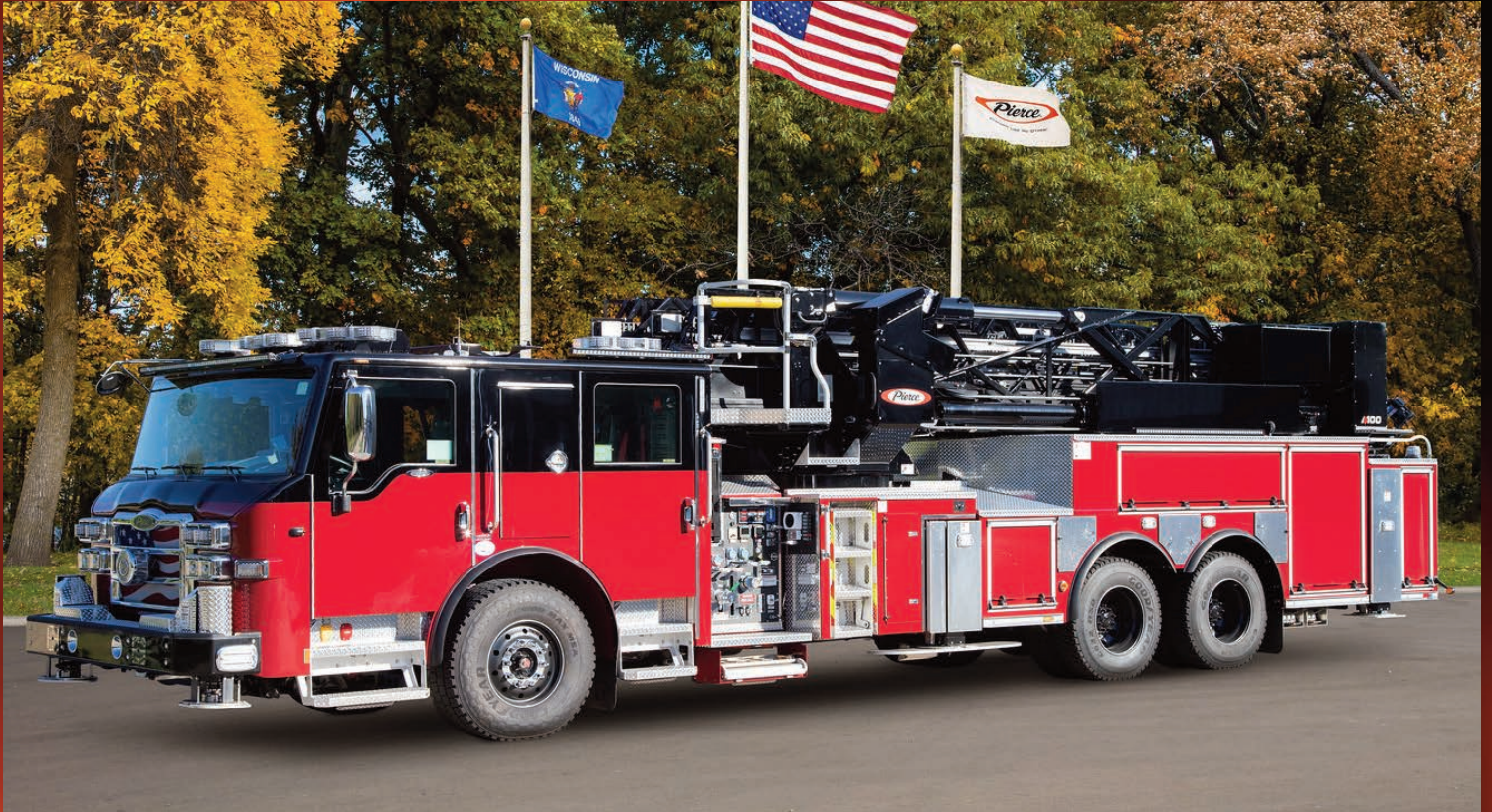
Pierce Velocity 100' Midmount Tower Woodbridge Fire District #1 Job #38262