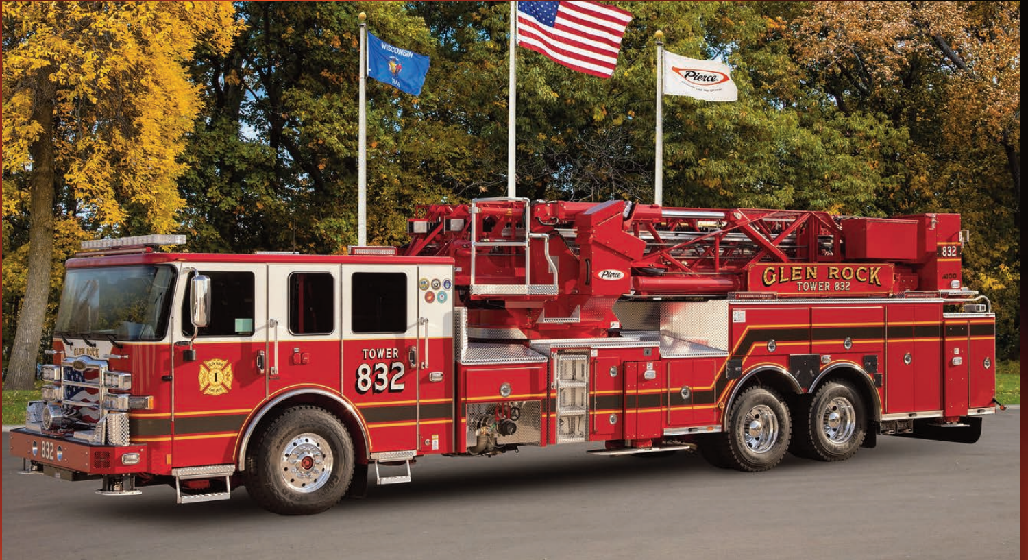
Pierce STOCK Enforcer 100' Midmount Tower Borough of Glen Rock Job #42118