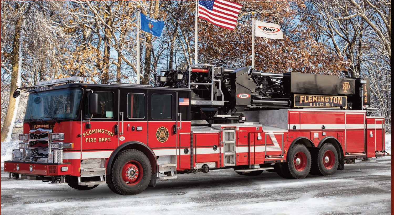
Pierce Enforcer 100' Midmount Tower Flemington Borough Job #39962